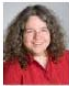
Professor Louise Potvin

VENUE: Flinders in the City - 182 Victoria Square (the old Reserve Bank Building) Enter from Flinders Street or Victoria Square